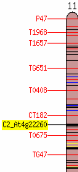
Fig.1: Map of the top of Chr. 11. (Modified from Solanaceae Genomics Network, 2006).